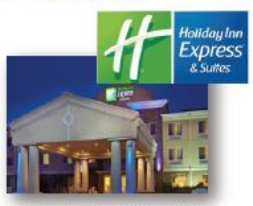
10804 $ 15th Street Bellevue, NE 68123